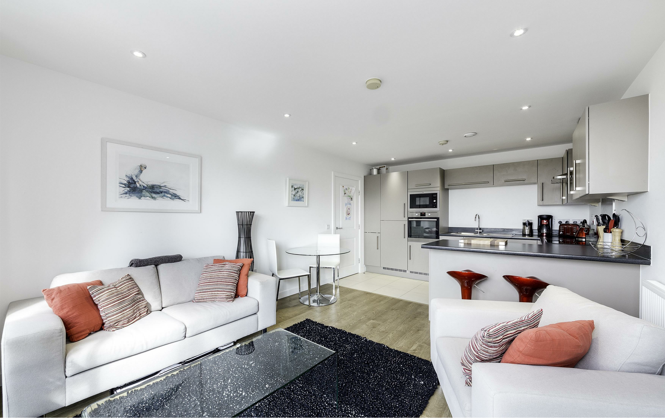
Apartment 804 Bootmakers Court, Ben Jonson Road, Limehouse London, E1 4GJ £365 Per week